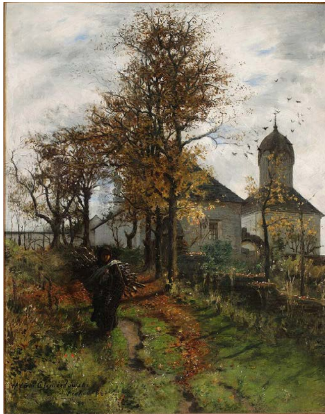
Albert Chmielowski