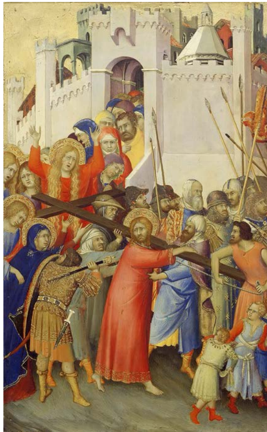
Simone Martini