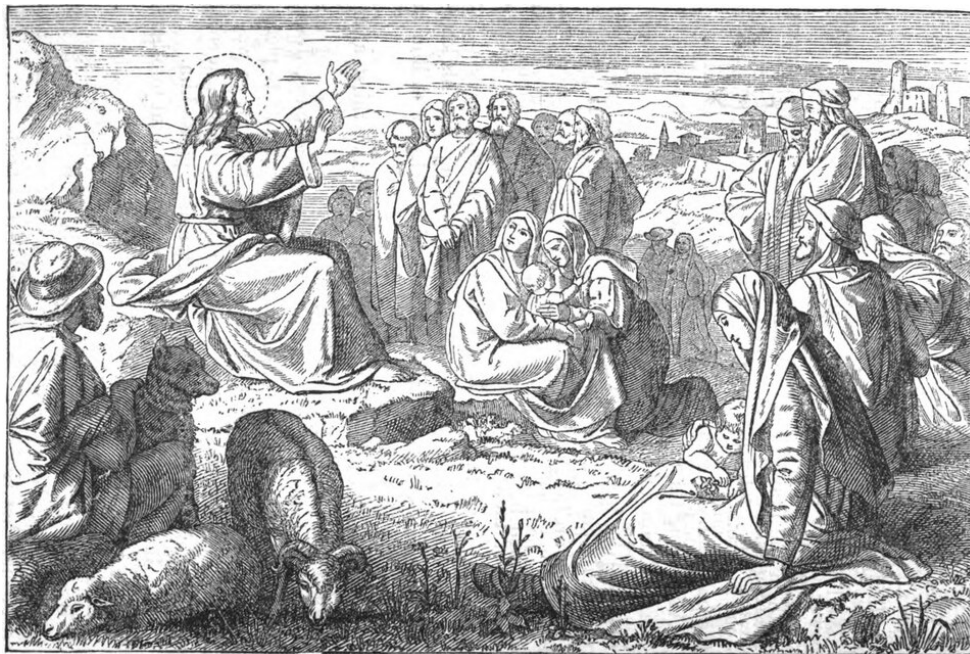
The story of the Bible from Genesis to Revelation

Source: USCCB Catechism Glossary, p. 875.