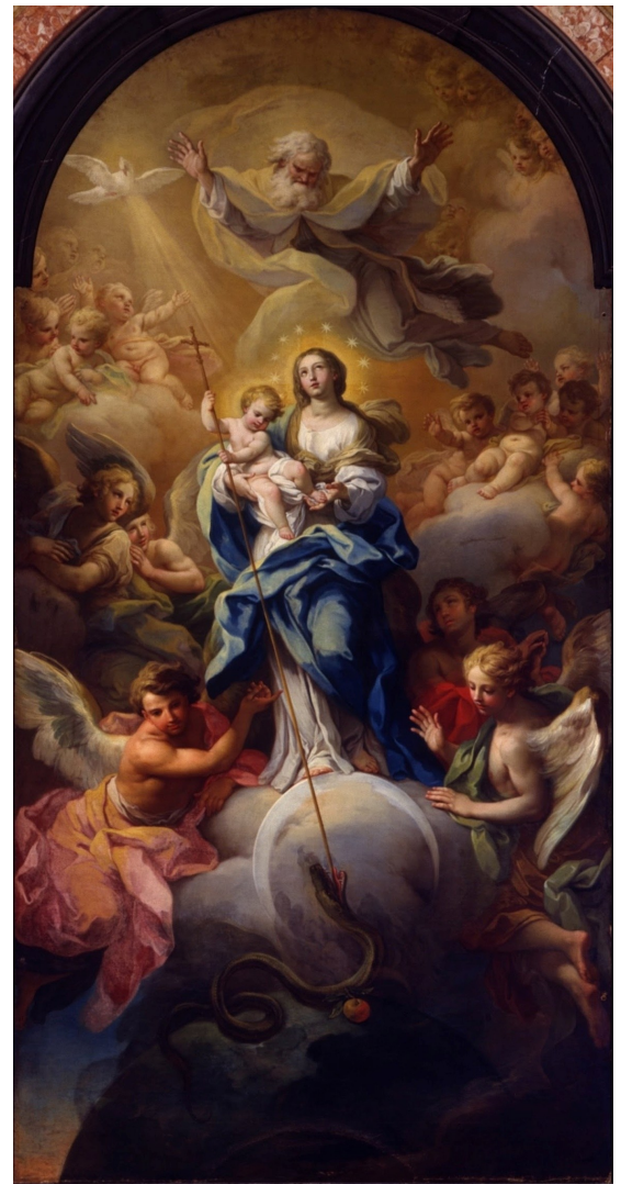
Immaculate Conception by Sebastiano Conca

Adaptations: Children who cannot share verbally can point to a Marian image, gesture, or hold up a card with a symbol like a lily (purity) or a heart.