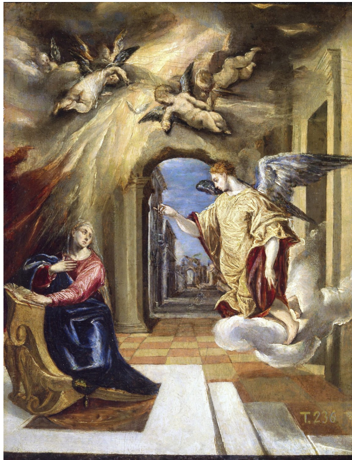
Annunciation by El Greco, Public domain, via Wikimedia Commons