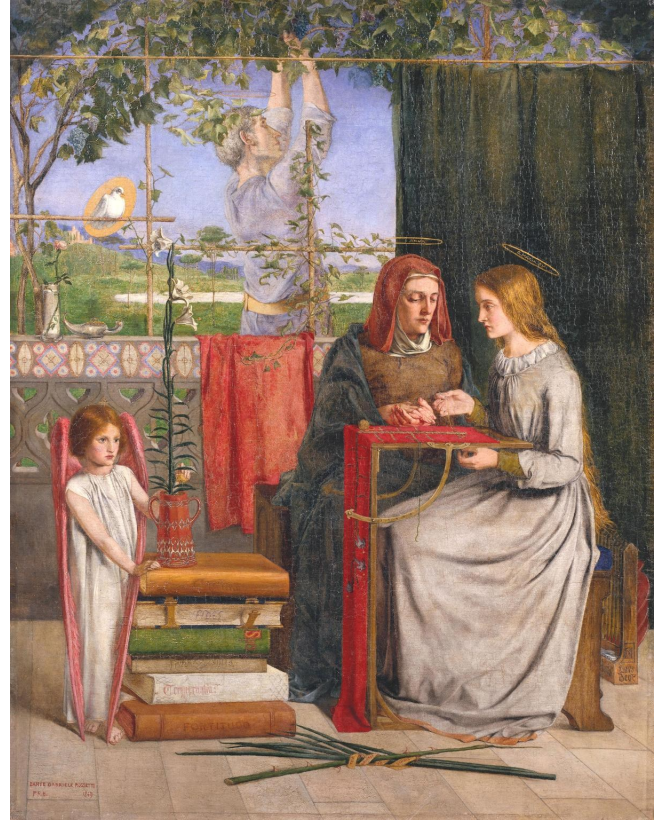
The Girlhood of Mary Virgin by Dante Gabriel Rossetti

Let's Read: While the Bible does not explicitly state that the Immaculate conception happened, we hear about it throughout the Bible. Let's take a look: