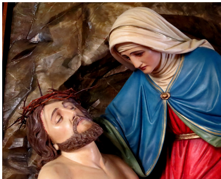
Mother of Sorrows statue

Mary is our Mother in heaven and sometimes we call her Mother Mary. In fact, Mary goes by a lot of names, so many names that you might not realize all of them are the same Mary, Jesus' mother. One name, Our Lady of Lourdes, comes from when a teenager saw Mary in the city of Lourdes, France many times over a few weeks. Some of the names are related to why we are asking Mary to pray for us. For example, when a loved one dies you might call Mary, Mother of Sorrows. Still other names, like Our Lady of Charity, are used to reflect Mary's connection to the values of the Church.