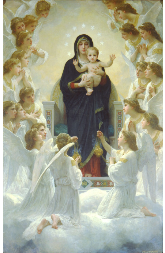
The Virgin with Angels by William-Adolphe Bouguereau