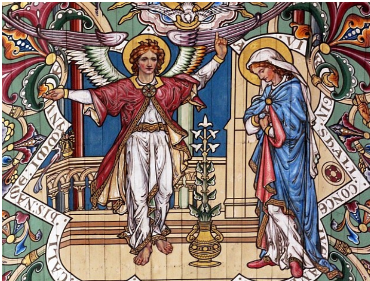
Gabriel visits Mary, painted ceiling, Ely cathedral

ALL: Come, Lord Jesus, and fill our hearts with peace. Help us to wait patiently for you.