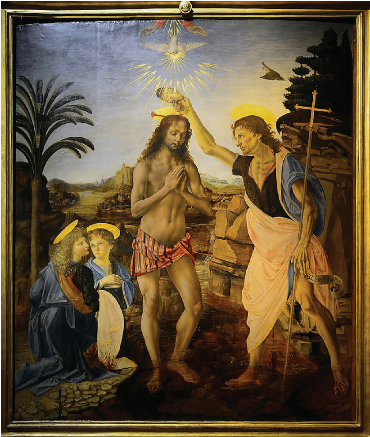
Baptism of Christ, Andrea del Verrocchio and Leonardo da Vinci