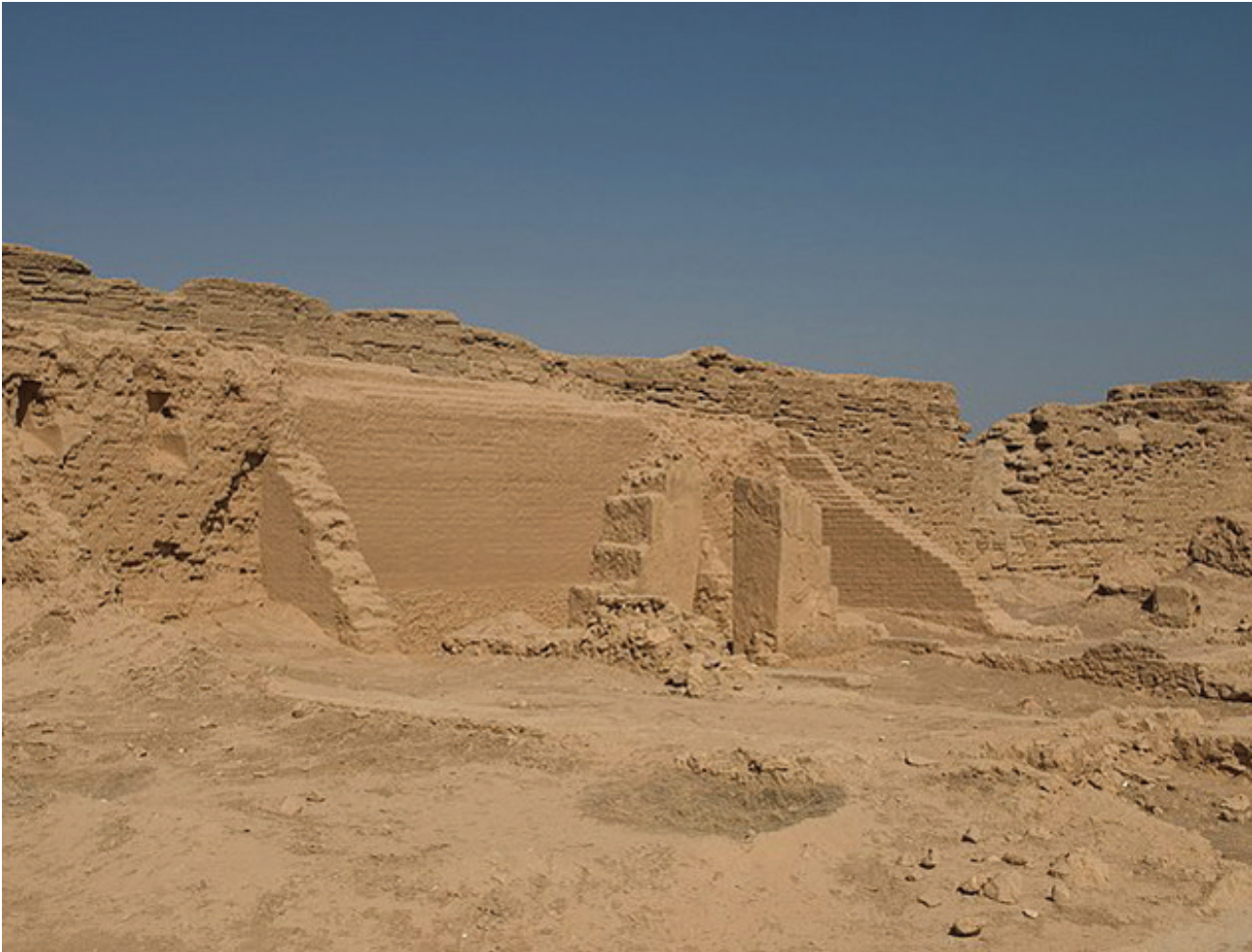
Remains of Dura-Europos House-Church, Marysas, Wikimedia Commons, Public Domain