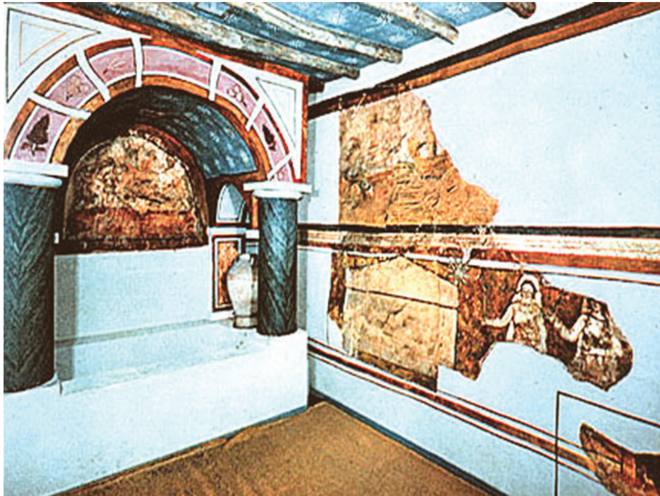
Dura-Europos Baptistry (Reconstruction)