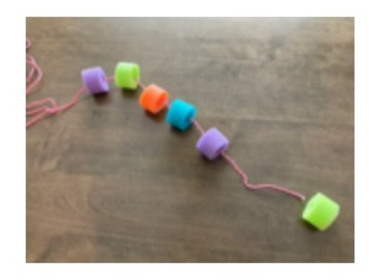
2. "Thread" slices onto string and tie ends together.