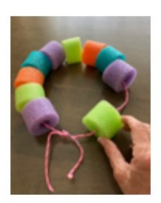
3. Slide/touch a noodle slice as each Hail Mary is recited.